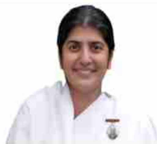
BK Shivani International Motivational Speaker, Brahma Kumaris