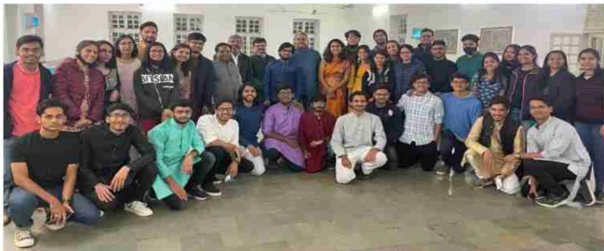
Nirmaan Vaccination Camp

Nirmaan, a voluntary organization initiated by BITS, Pilani students in 2005, works in the areas of education, livelihoods and social leadership. Nirmaan conducted vaccination drives on September 29, 2021 in Nat Basti and Khelda Bass. The first vaccination camp was organised with the help of the Government of Rajasthan that provided awareness and transportation facilities to all the beneficiaries. The second vaccination camp was organised by PHC, Pilani, at Nirmaan's old Unnati centre. The vaccination drives saw over 100 vaccinations.