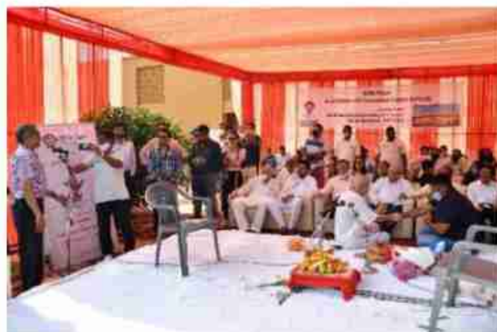
Foundation Stone Ceremony of BPIInC

The event was attended by various alumni, their family, staff and faculty members. The Center is expected to be operational in 2022.