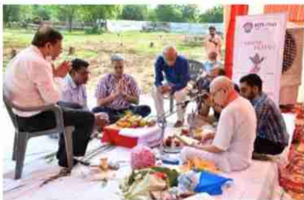
Foundation Stone Ceremony of BPIInC