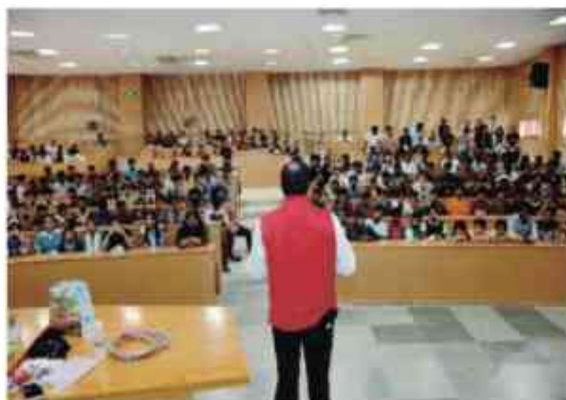
Kids enjoying a magic show during Ignite

There is no greater joy than giving joy to others. This is the primary intent behind, Ignite, an annual social fest conducted by Nirmaan, BPHC. Over the course of 3 days, children from unprivileged backgrounds are brought to the campus to participate in a series of educational and entertaining events. It is a rewarding opportunity to give back to society directly, by spending time, teaching and guiding the children.