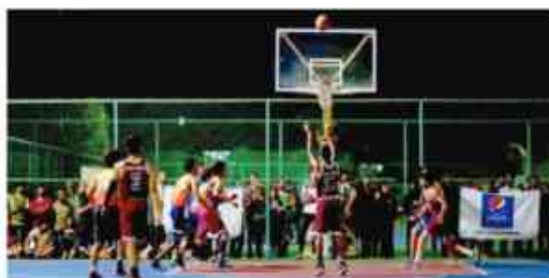
A basketball match in progress