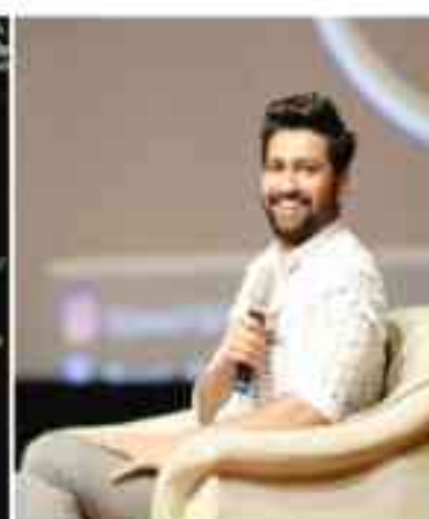
A talk by Bollywood actor Vicky Kaushal