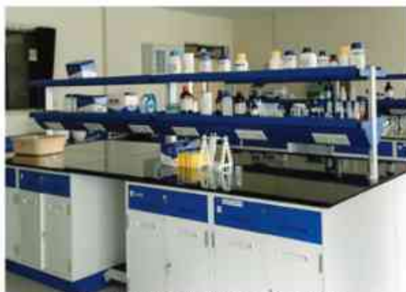
Translational pharmaceuticals research laboratory

X-ray Photoelectron Spectroscopy (XPS), a high end instrument was installed in the Central Analytical Lab (May 2019). Approximately priced around three crore rupees, this instrument is significant in determining the surface elemental compositions and the elements' oxidation states in solid substances.