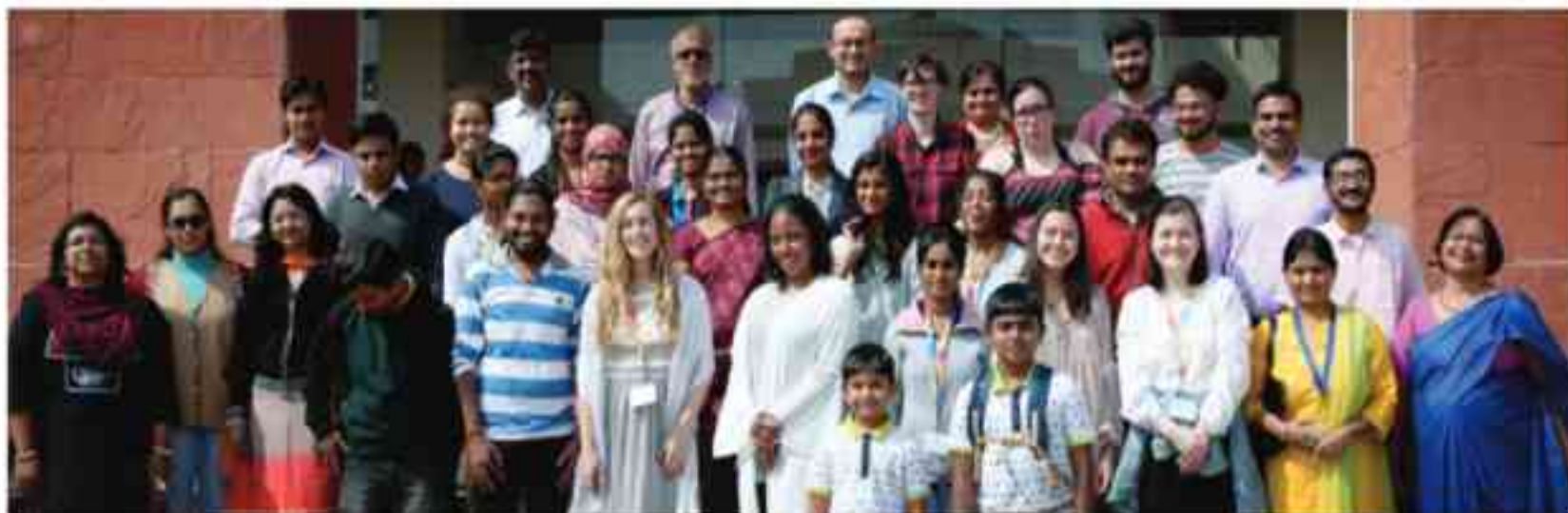
Participants of WIGH 2019