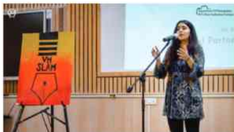
Slam poetry performance by a participant at VM Slam finals

The annual literary fest of BITS Pilani, Hyderabad Campus was held on the January 19-20. The event was conducted by the literary clubs on campus, including the English Language Activities Society, the Hindi Tarang, the Sanskrit and Foreign Languages Club and the Journal Club. The theme for this year, was 'Change Beings With Ink', which aimed to highlight the importance of literature and the power of words to bring about revolutionary changes in our society.