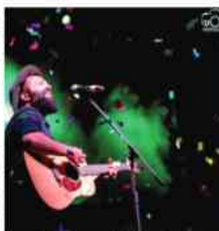
Performance by Indian Band 'When Chal Met Toast'

Contingents arrived from every corner of the country, to participate in a wide range of events. With competitions spanning photography, music, dance, drama, literature, fashion and many more, there was no shortage of talent displayed. At night, the campus remained enthused with energy and zest thanks to the brilliant proshows.