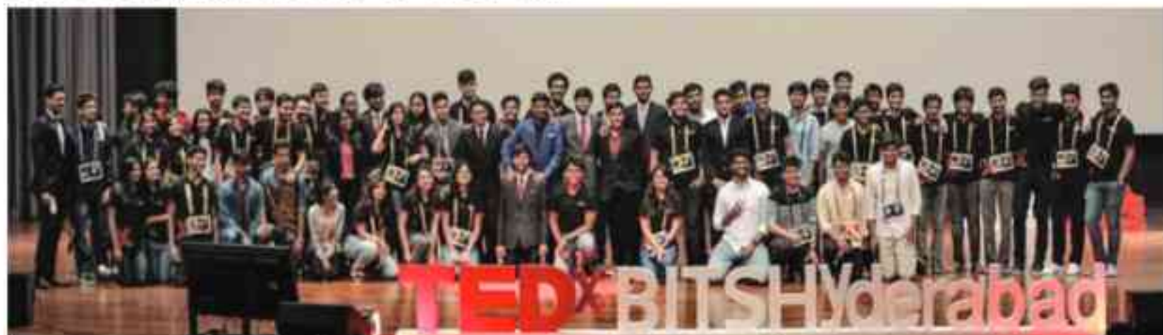
Organizing committee of TedX BITS Hyderabad 2019 with the nine speakers invited for the talk, on the auditorium stage

The wide range of enthralling experiences shared by the speakers, as they spoke about each of their journeys, was fascinating. Apart from the talks, the attendees also had the rare opportunity to interact with all the speakers and discover more about the roads less taken.