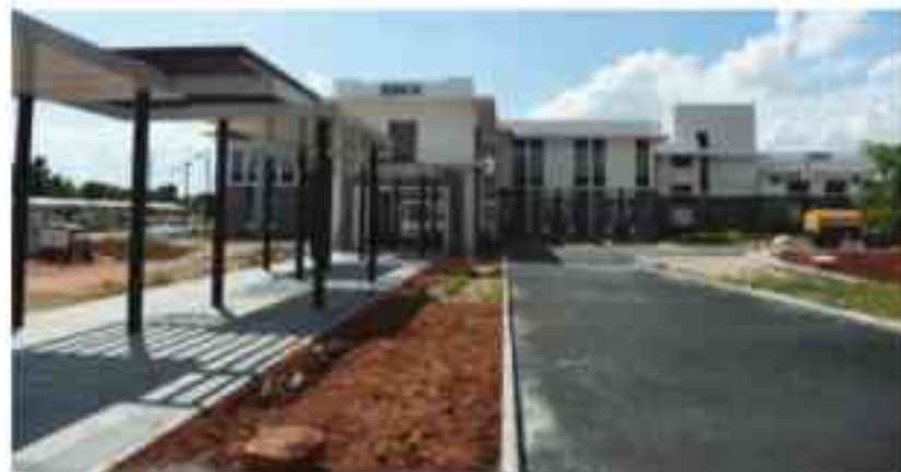
Academic Block 'K'