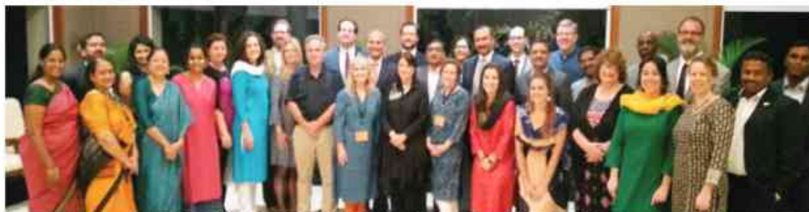
Officials of USIEF, US Consulate and Fulbright-Nehru International Education Administrators