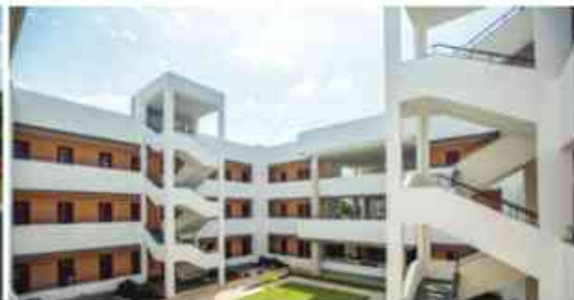
Academic Block 'J'