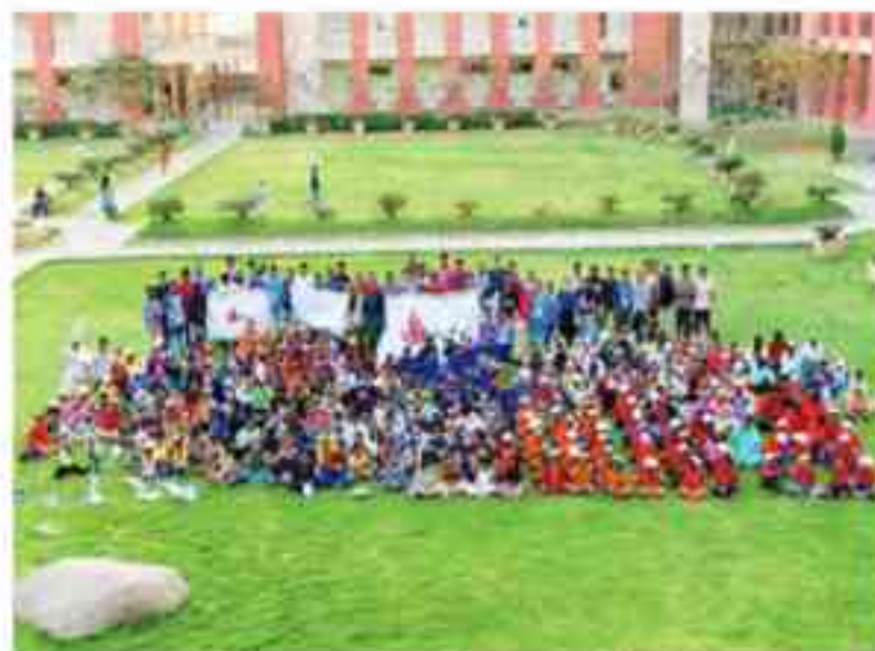
Volunteers and participants during Ignite

Both the children and the volunteers took a lot away from the event, in terms of both learning and the memories that were made.