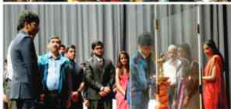
Inaugural ceremony of ARENA '19