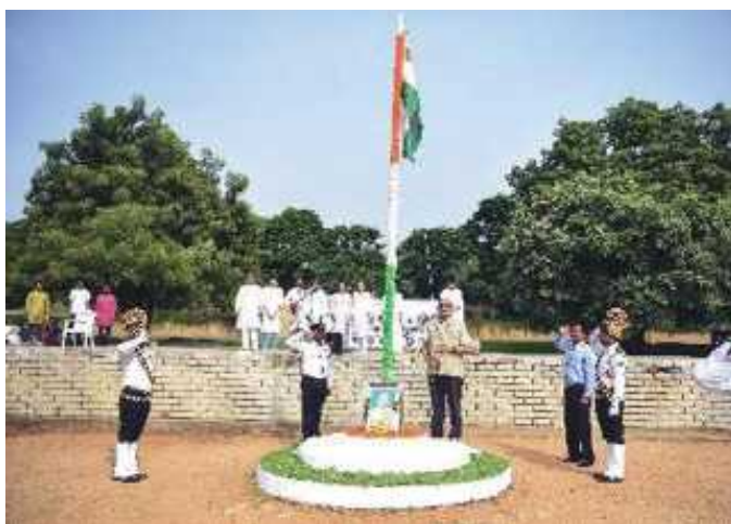
Flag Hoisting by the Director