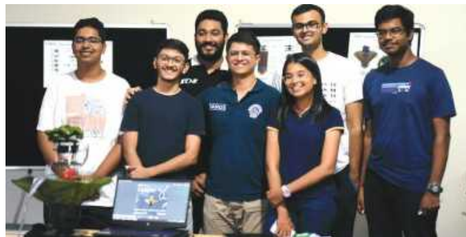
Team JANUS presenting their latest CanSat model

This annual event, held by SEDS on 12 th August, commemorated Team JANUS for their outstanding achievements in the International CanSat Competition. Previously, Team Janus secured the 1 st rank worldwide in the Preliminary Design Round of the CanSat competition with a perfect score. With the team qualifying for the final on-site stage of the competition for the third consecutive time in 2024, the team displayed their latest CanSat model for students aiming to dive into the cutting edge of aerospace innovation.