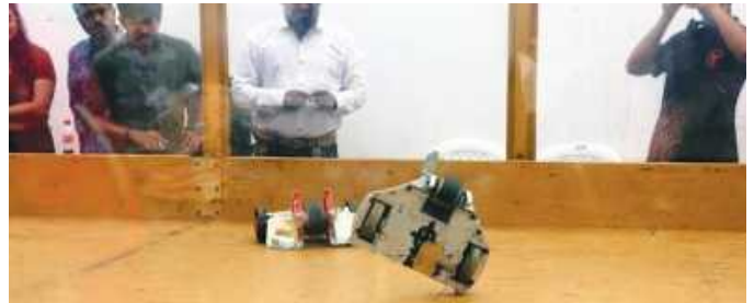
The combat bots in action during Robowars India League

The headliner events, invited the best teams from across the country to represent their institutes in fierce battles. With growing combat robotic enthusiasts, Robowars India League proved to be the crowd-puller. With our own Team Thriveforce competing, students excitedly gathered to see these lethal bots conquer the arena. The third edition of BITS Drone Racing League had over 15 drones racing through challenging obstacle courses on campus. Finally, the SAE organised Auto Expo and Time Attack Race had five custom-built ATV's in an ultimate off-road challenge.