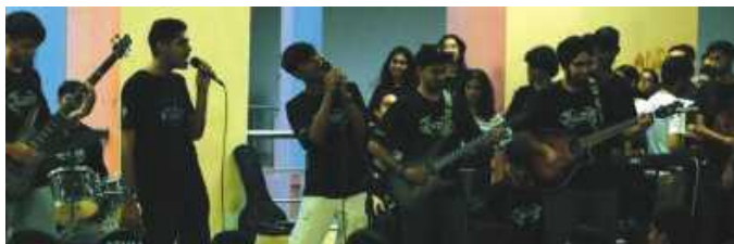
Students performing in the Open Mic Jam Session

This BITSian's Day marked BITS Pilani's Diamond Jubilee, and was celebrated across the world from 2 nd -3 rd August. In our campus, we celebrated BITSian's Day with great enthusiasm and excitement with events organised by SARC. With over a thousand participants across all the events conducted, the day was celebrated in accordance with the momentous milestone.