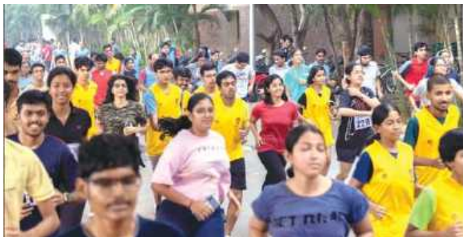
Independence Day Marathon