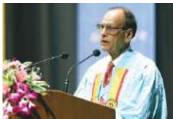
Chief Guest address

This convocation will undoubtedly remain etched in the memories of all who attended as a landmark event celebrating the achievements of the BITS Pilani Hyderabad Campus Class of 2024.