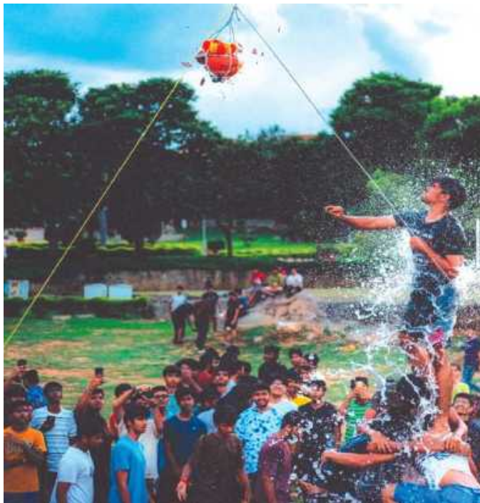
Dahi Handi Breaking Event

The Maharashtra Mandal and Brindavanam Telugu Samithi conducted a Shri Krishna Janmashtami celebration. This unifying festival of liberation and joy was celebrated with the exciting Dahi Handi Breaking and Dandiya events.