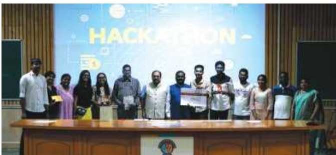
The National TechXcelerate Hackathon (2024) - BITS Pilani, Hyderabad Campus Edition

Multiple student-led workshops offered a more hands-on experience, with R Programming, Advanced Rocket Engineering, DSA, Game Development, Generative AI, Stock Market, Product Management, Gravity Simulation, Soap Making workshops among others. For students itching to showcase their competitive spirit, there were hackathons, Krafton ESports competitions, and even uniquely themed games - Crime Scene Investigation, Chem-Casino, Space Escape, The Singularity, Concrete Bowling and many more!