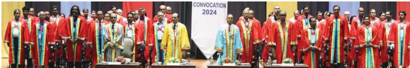
Delegates of the convocation

The Birla Institute of Technology and Science (BITS), Pilani, Hyderabad Campus, celebrated its annual convocation ceremony on August 4, 2024. The grand event was held in the campus auditorium, with an atmosphere of pride, excitement, and nostalgia as graduating students marked the culmination of their academic journeys.