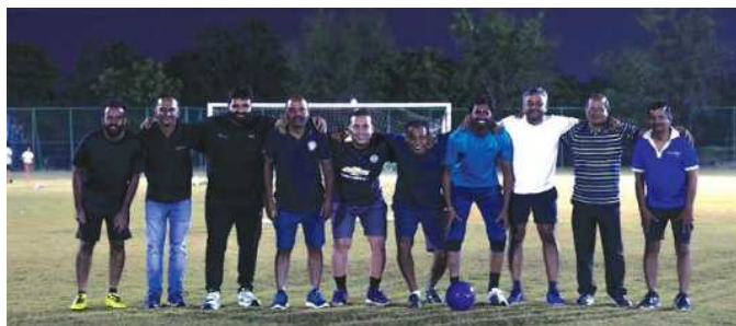
Mens Football Team

Men's Day 2024 was celebrated with a series of exciting events. On November 9, 2024, the day featured a parking skill test, a pani puri eating competition, and a friendly football match. The celebrations concluded with a fun-filled session of games and prize distribution on November 28, 2024. As part of the festivities, raincoats were also distributed to outsourced employees and security personnel, adding a thoughtful gesture to the Men's Day celebrations.