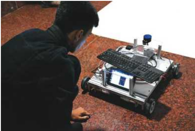
Demonstration during the Tech Expo

Multiple student-led workshops offered a more hands-on experience, with R Programming, Advanced Rocket Engineering, DSA, Game Development, Generative AI, Stock Market, Product Management, Gravity Simulation, Soap Making workshops among others. For students itching to showcase their competitive spirit, there were hackathons, Krafton ESports competitions, and even uniquely themed games - Crime Scene Investigation, Chem-Casino, Space Escape, The Singularity, Concrete Bowling and many more!