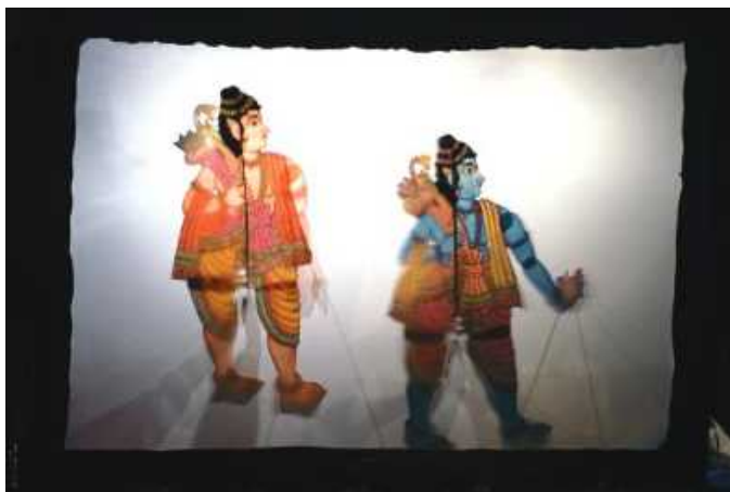
Still from Enactment of Ramayana - Tolu Bommalata

filled evening by showing us the story of Ramayana using elaborate puppets and intricate movements.