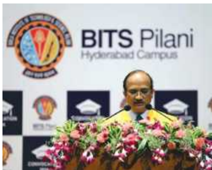
Vice Chancellor's address