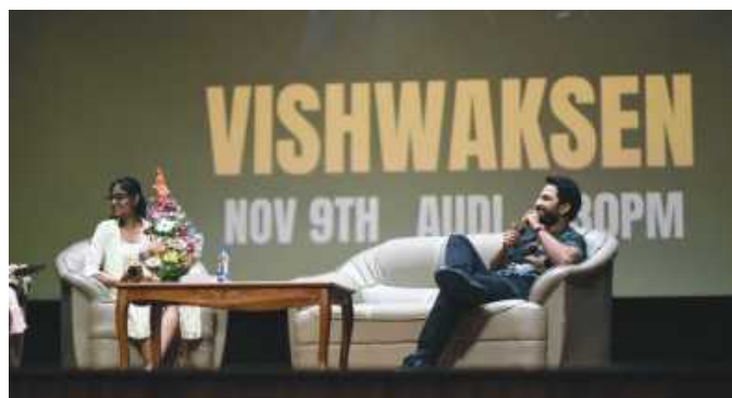
Vishwak Sen interacting with the students

a unique perspective into their success. Students even got a chance to interact with the electrifying Vishwak Sen, who visited to promote his movie 'Mechanic Rocky'.