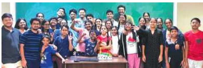
Children's Day Celebrations during Project Parishkaar

Project Parishkaar, an initiative by Nirmaan, aims to foster the children of the non-teaching staff at BITS to realise their full potential. The project ran throughout the semester, where children from grades 1-10 were tutored by students of the BITS Pilani, Hyderabad Campus in the subjects of Math, Science, Social Science and Languages according to the children's needs.