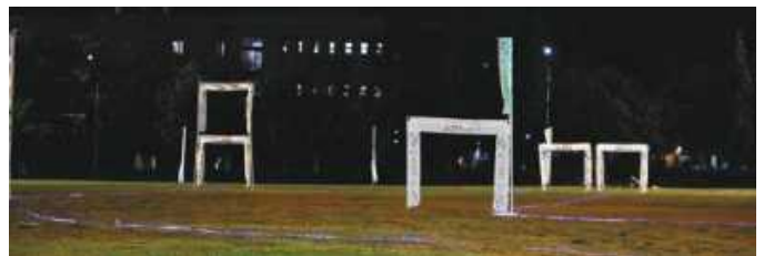
BITS Drone Racing League Finals