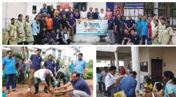
Swachhata Hi Seva Activities

As a gesture of appreciation, saplings were given to all participants, and sustainable gifts were awarded to the winners of the competitions.