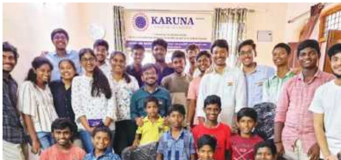
The NSS Team with the Children of the Karuna Volunteering Organisation Orphanage